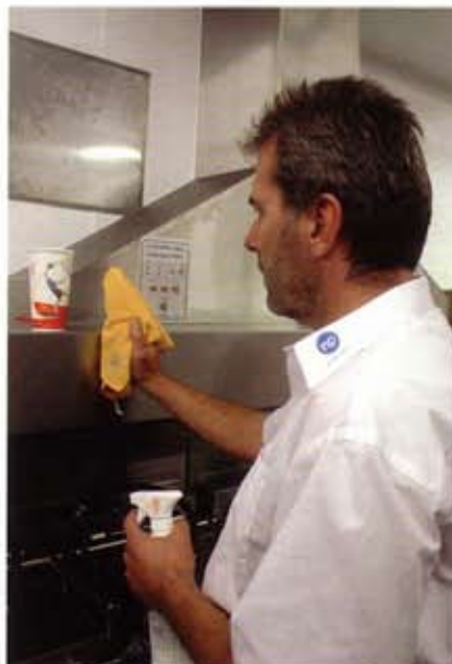
Many food prep areas have already been treated with the easy clean coating

or potentially harmful engineered nanoparticles