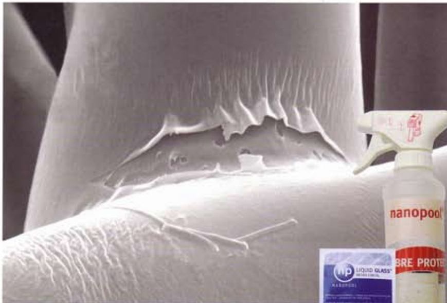
The liquid coating is around 100nm thick

◀ substrate. Hard surfaces, such as wash basins, tabletops or telephones, can be subjected to loading within 60 seconds of being coated.